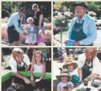
Many loyal volunteers have become familiar faces at the Ballarat Begonia Festival over the decades.

If you would like to be a Ballarat Begonia Festival volunteer next year please call 1800 656 374.